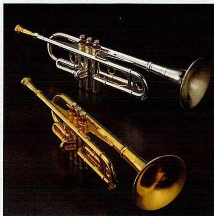
Best Brass Aiolia Series trumpets.

explains that the valve system found on most modern-day brass instruments was invented about 100 years ago and "has-